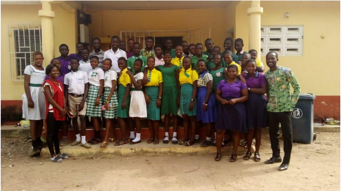
Figure 5: A group picture of facilitators, volunteers, teachers and Children Parliamentarians after the training on the first day