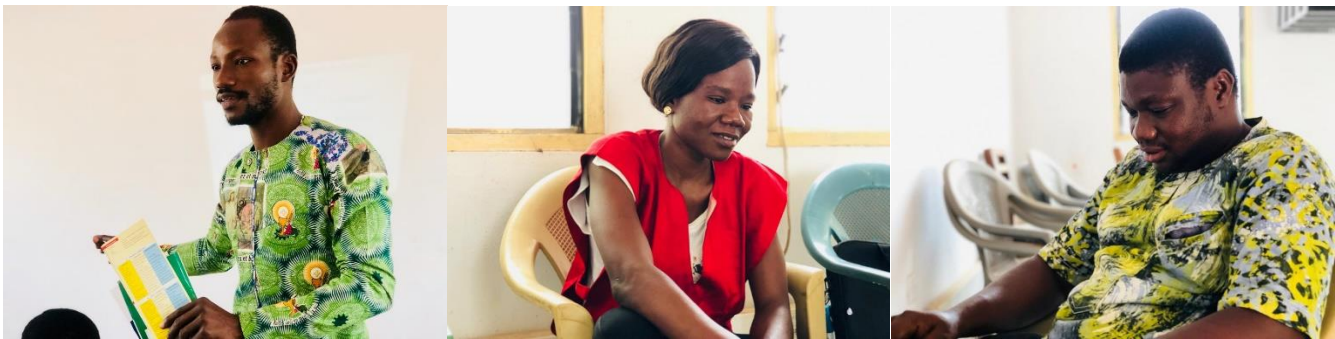
Figure 4: Some volunteers of the Saboba Youth Centre who supported in various capacities during the training of the Children Parliamentarians.