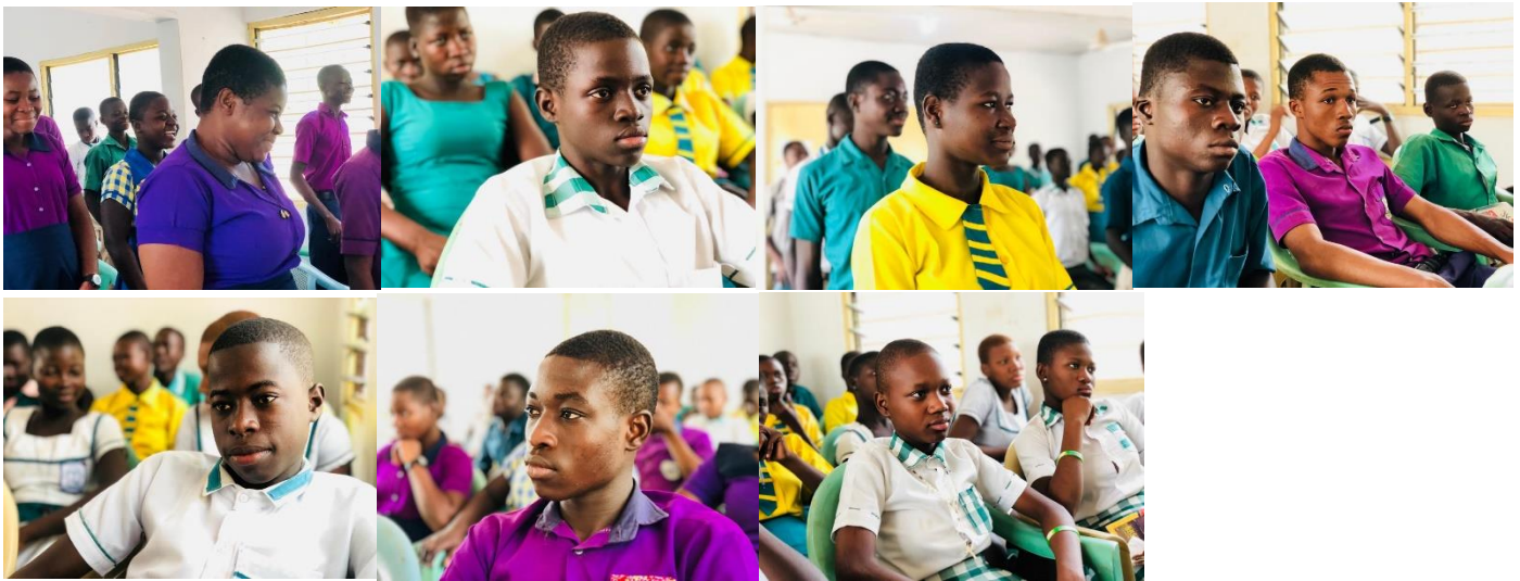
Figure 1: A section of the student participants at the training session of the Children Parliamentarians